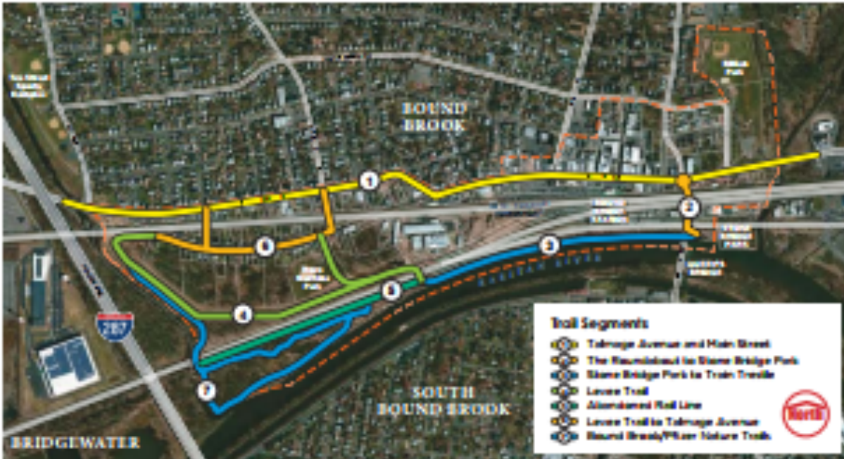
Fig 2. Trail Segment Key Map

In 2017, a steering committee of Borough officials, staff and professionals, along with representatives of Somerset County and large landowners in the project area (NJ American Water, Pfizer) – and with the assistance of a facilitator from the US Park Service -- began to implement aspects of the Plan, and to develop a strategic plan for longer-term implementation. Most elements of the trail system will require significant collaboration with non-local institutions such as Conrail, which operates active freight rail lines in the trail area, NJ Transit, which operates the Raritan Valley passenger rail line, the US Army Corps of Engineers / New Jersey Department of Environmental Protection, as well as partnerships with Pfizer and with NJAW.