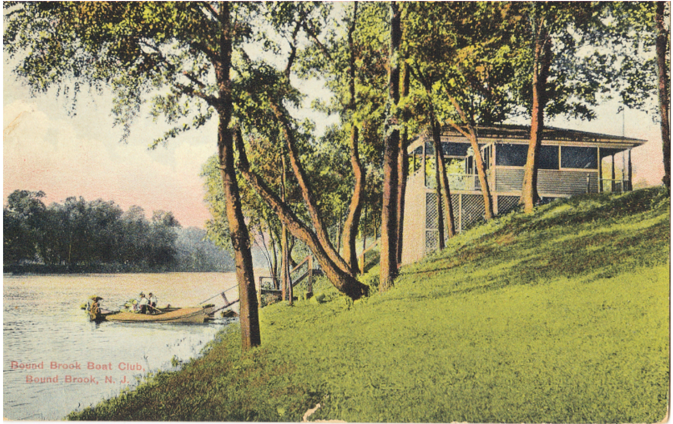
Bound Brook Boat Club on the banks of the Raritan River at the turn of the 20 th century

The Borough is in the process of hiring a consultant to assist the Planning Board in developing a circulation plan element for the Master Plan. The emphasis of the circulation plan element will be not on motor vehicle circulation, but rather on facilitating pedestrian, bicycle and transit use, through the comprehensive application of a complete street strategy, as well as pedestrian counter measures, where warranted.