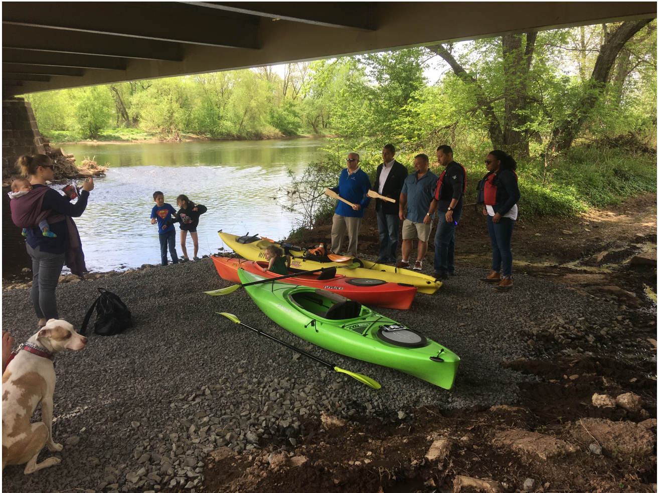
Canoe and kayak put-in inauguration in May of 2018.

Following the 2017 Master Plan Reexamination Report, the Borough enacted a number of its recommendations regarding re-zoning of certain districts. The previous single-use framework was modified in a number of locations and replaced with a mixed-use framework. The industrial designation, which applied to all areas South of the downtown, was dramatically shrunk, and replaced with a new Open Space-Civic designation – which applies to parks and schools, as well as lands that are environmentally sensitive. Railroad rights-of-way were zoned as such: railroad. Other alterations also took place.