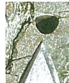
D-shaped exit hole