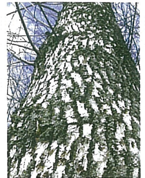
Woodpecker damage on an EAB infested tree